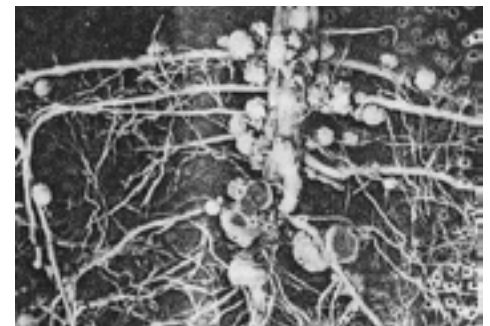
Nitrogen fixing nodules on the roots of a legume

Some of the major activities of soil bacteria include nitrogen fixation, decomposing organic matter into humus and solubilising inorganic mineral elements.