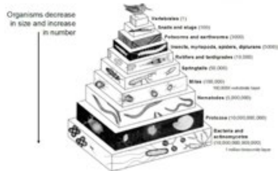
Diagram courtesy, Soil Fertility Services