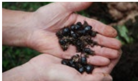
Active Dung beetles

Dung beetles are important animals in the soil ecosystem. They bury animal manure, stimulate nutrient cycling, aerate the soil, improve water infiltration reducing the habitat of the bush fly.